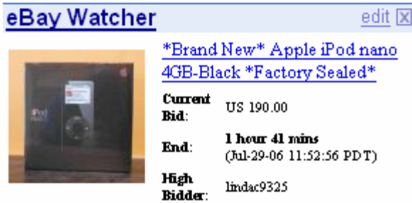
Figure 1: The Watcher for eBay scenario involves using retrieved data from eBay to generate an HTML table that is injected into an iGoogle portlet.